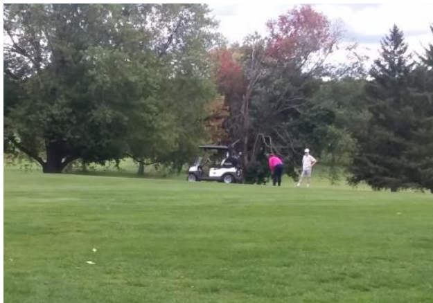
On the green at the Canajoharie Golf Tournament

The Foundation for Mohawk Valley Libraries supports the Mohawk Valley Library System, providing funding that helps the fourteen member libraries in Fulton, Montgomery, Schenectady and Schoharie Counties. The Foundation is a fully registered public charity with a mission of raising money to benefit libraries.