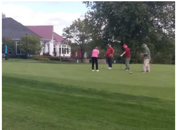
Foundation golfers at the Van Patten Golf Club

For our second golf tournament, we traveled to the Van Patten Golf Club in Clifton Park on September 26. This was another small but successful tournament where 20 golfers along with donors and volunteers helped the Foundation raise over $3,000 in profit. Again, thanks to all who worked to make this possible.