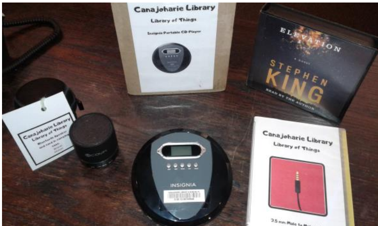
Canajoharie "Library of Things" purchased through a Foundation grant

Member libraries also received assistance through the Advocacy Grant program. This grant program allows libraries to use grant funding to increase their community engagement and local public funding. Several libraries held successful library proposition campaigns to boost the community's investment in the library. The Johnstown Public Library was successful in changing their charter to a school district public library. These efforts will continue in 2019.