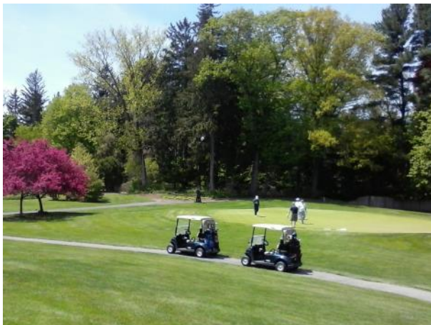
A gorgeous day at the Mohawk Golf Tournament

The Foundation for Mohawk Valley Libraries supports the Mohawk Valley Library System, providing funding that helps the fourteen member libraries in Fulton, Montgomery, Schenectady and Schoharie Counties. The Foundation is a fully registered public charity with a mission of raising money to benefit libraries.