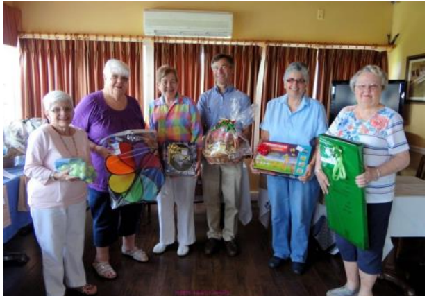
Canajoharie Golf Tournament Basket Raffle