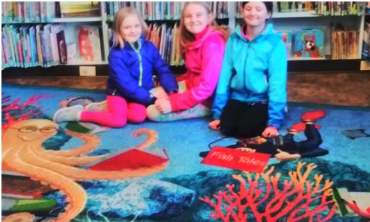
Fonda children enjoying the rug purchased through a Foundation grant

Member libraries also received assistance through the Advocacy Grant program. This grant program allows libraries to use grant funding to increase their community engagement and local public funding. Several libraries held successful library proposition campaigns to boost the community's investment in the library. The Johnstown Public Library worked on changing their charter to a school district public library. These efforts will continue in 2018.