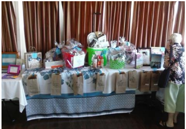
Canajoharie Golf Tournament Basket Raffle