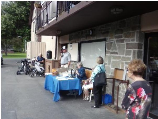
Volunteers at the Mohawk Golf Tournament

The Foundation for Mohawk Valley Libraries supports the Mohawk Valley Library System, providing funding that helps the fourteen member libraries in Fulton, Montgomery, Schenectady and Schoharie Counties. The Foundation is a fully registered public charity with a mission of raising money to benefit libraries.