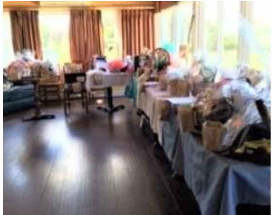
Canajoharie Golf Tournament Basket Raffle