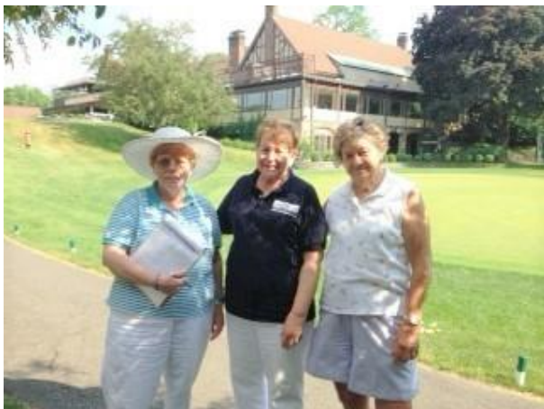
Volunteers at the Mohawk Golf Tournament

The Foundation for Mohawk Valley Libraries supports the Mohawk Valley Library System, providing funding that helps the fourteen member libraries in Fulton, Montgomery, Schenectady and Schoharie Counties. The Foundation is a fully registered public charity with a mission of raising money to benefit libraries.